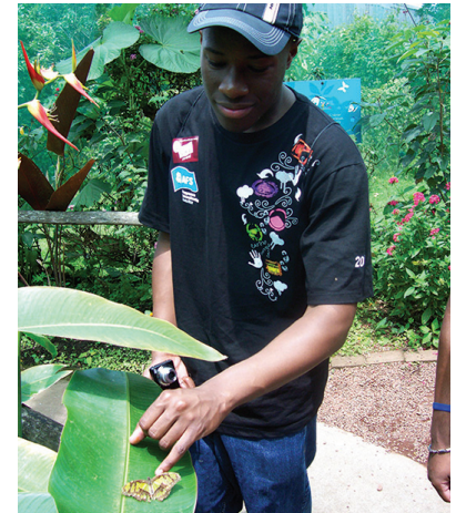
FoA scholar on community service program in Costa Rica.

AFS-USA's Faces of America (FoA) is the signature diversity scholarship program of AFS Intercultural Programs/USA. FoA provides high achieving, low-income students with a once-in-a-lifetime experience that would typically be out of their reach - studying abroad as a high school student. Through Faces of America, students from underserved communities engage in summer, semester and year-long international exchange opportunities that allow them to experience life from within a new culture, and to acquire the skills and networks that will help them become part of an emerging, global workforce. Since 2007, FoA has provided opportunities to over 630 students from under represented communities who have participated on AFS programs in over 25 countries.