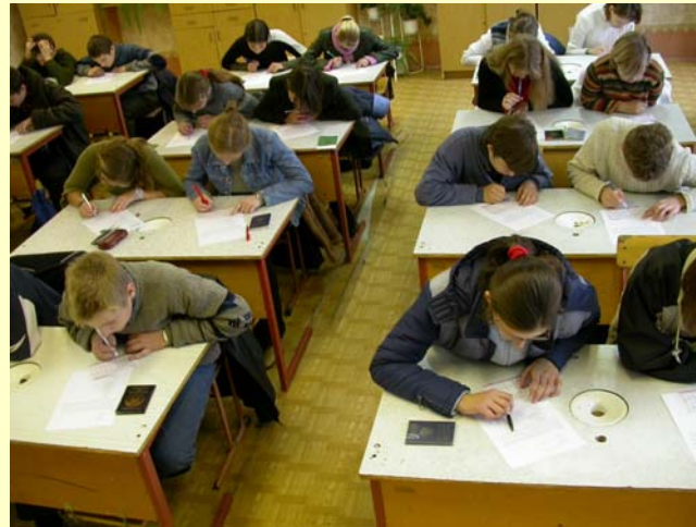
Left: Students writing essays at Round 3