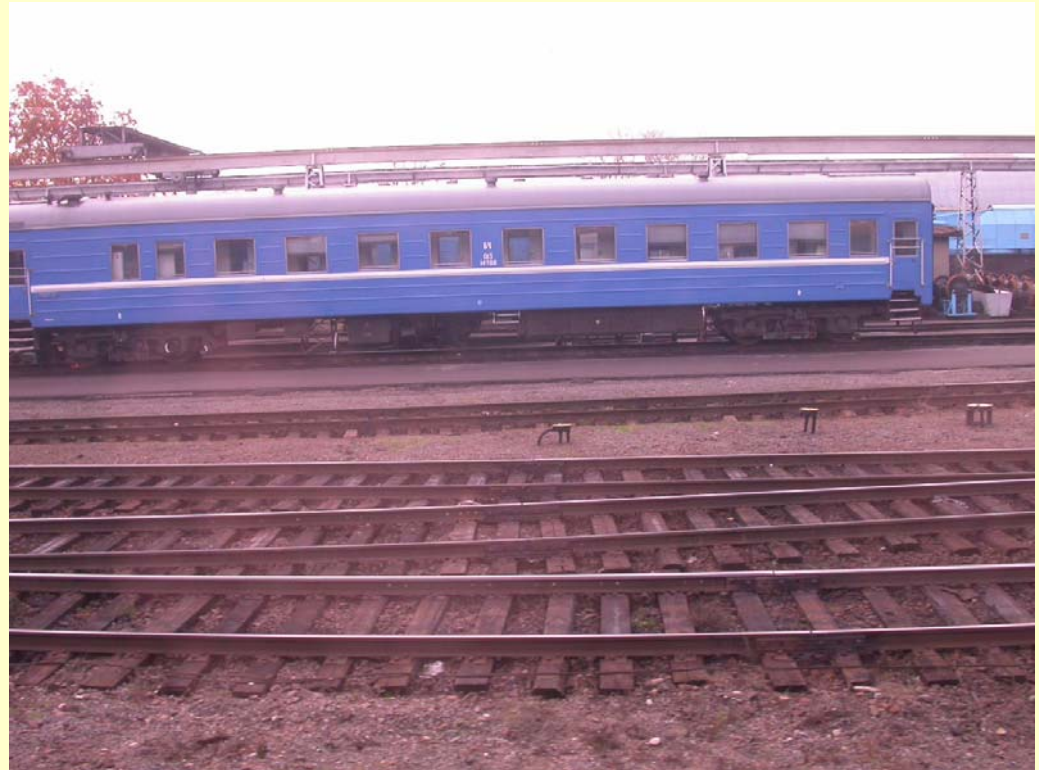
A typical train car in Eurasia – one of the recruitment team's most common form of transportation