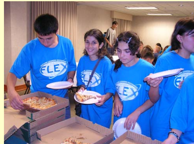
Students overnight at a Dulles airport hotel and enjoy a relaxing pizza dinner