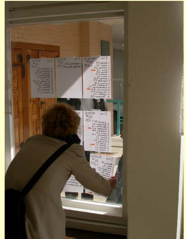
A student checks the list indicating who has passed from Round 1 to Round 2