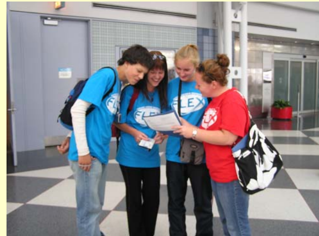
Staff in red t-shirts help traveling students in blue t-shirts in Chicago's O'Hare airport