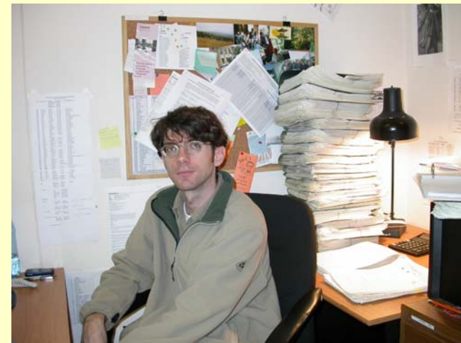
Below: Moscow staff with a stack of Round 3 application materials towering in the background